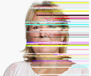
D F G M D K A