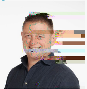
C D CEO K P